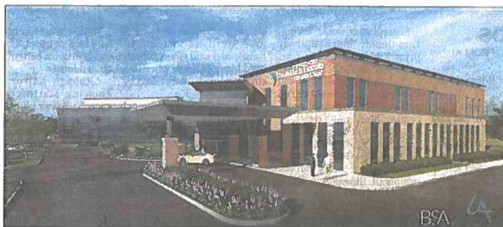
Artist's rendering of planned SBL Bonutti Clinic