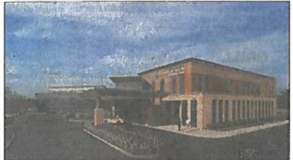
Artist's rendering of planned SBL Bonutti Clinic

• Diagnostic imaging including general radiology,