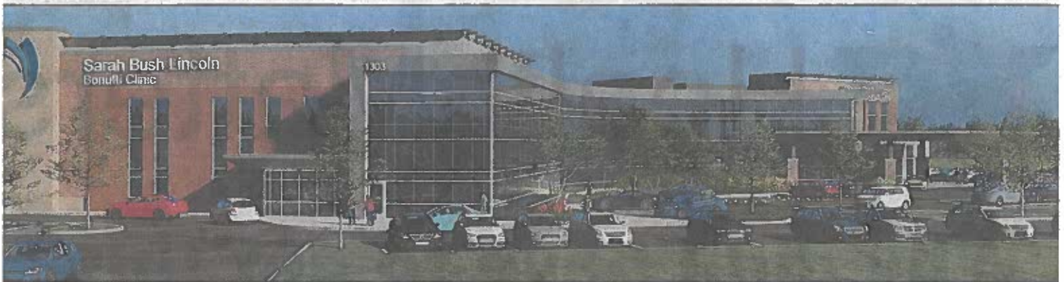
Here is a rendition of what SBL Bonutti Clinic will look like when finished. Construction could begin as early October.