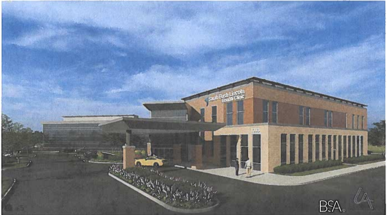
SBL Bonutti Clinic just waiting on state permit for $35M building

Our View: We're listening as SBL and St. Anthony's make their cases for and against Bonutti Clinic project