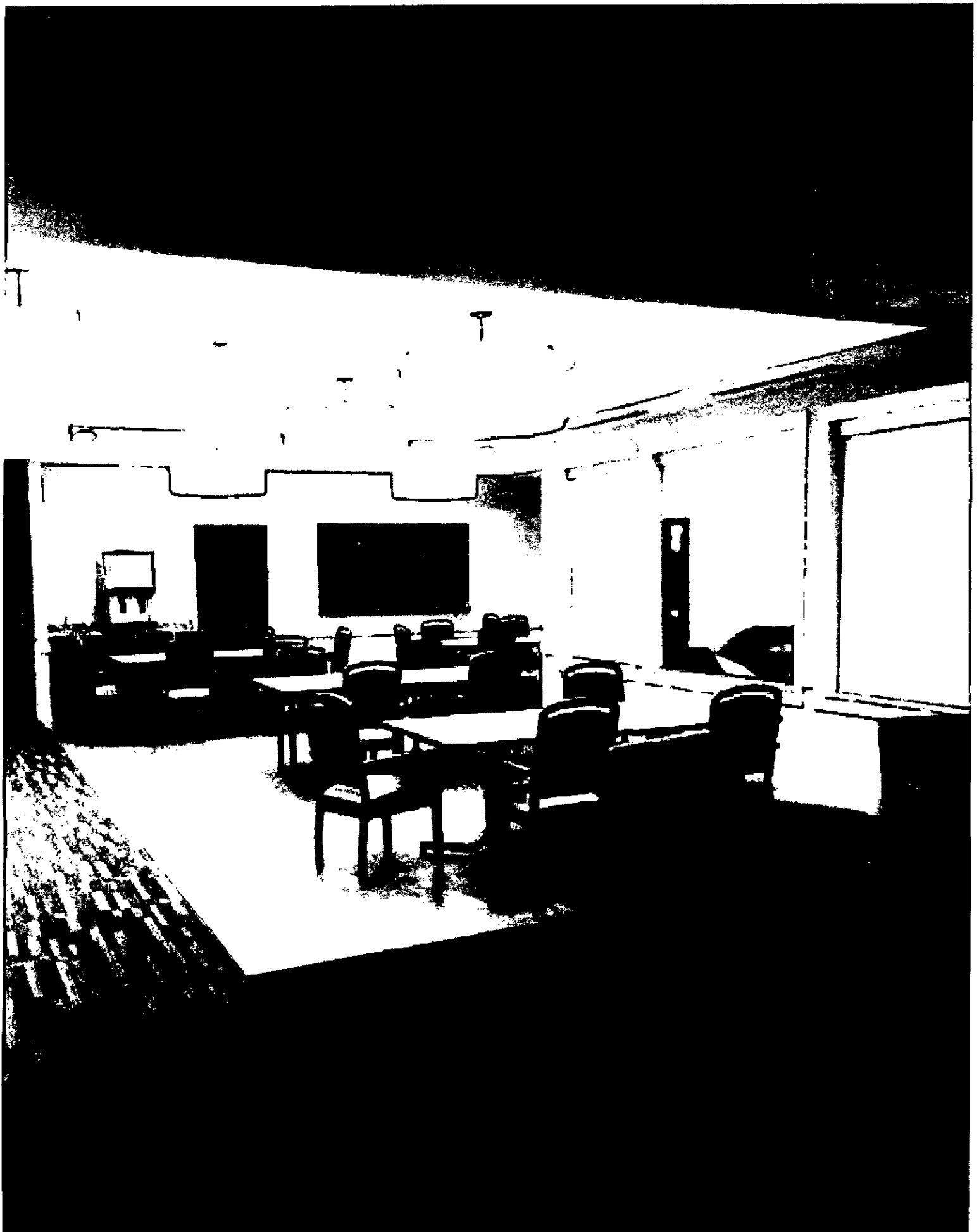
REACH Dining Room