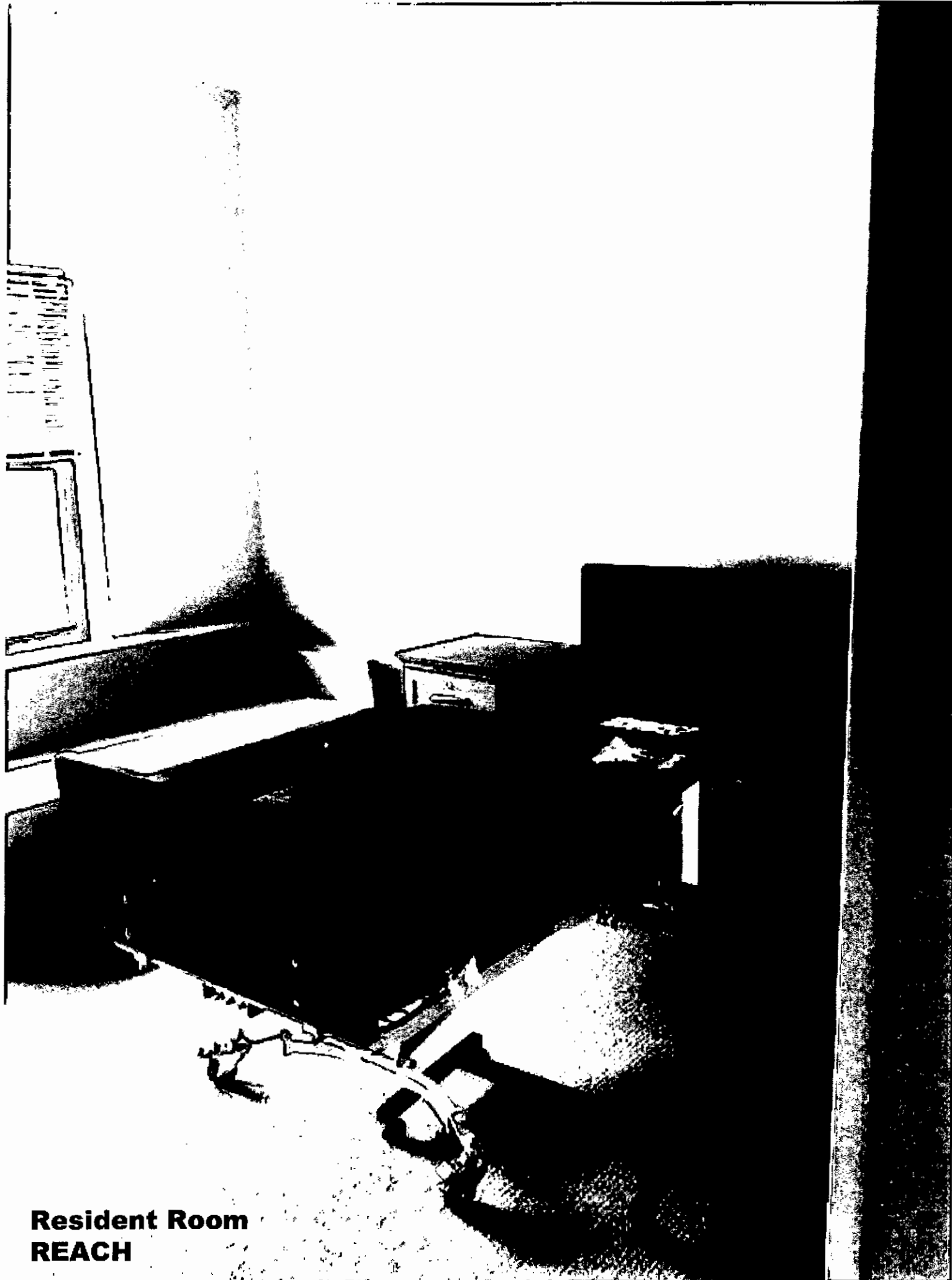
Resident Room REACH